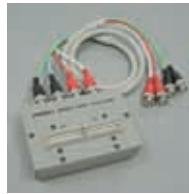
9261 TEST FIXTURE DC to 5 MHz