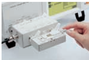
Example of connecting the 9262 and 9268 / 9269

The 9268 can be used for voltages up to a maximum of DC \pm 40 V. The 9269 can be used for currents up to a maximum of DC \pm 2 A.