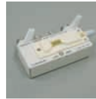
9263 SMD TEST FIXTURE DC to 5 MHz