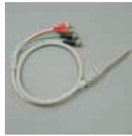
9143 PINCHER PROBE DC to 5 MHz