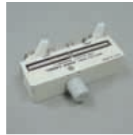
9262 TEST FIXTURE DC to 5 MHz