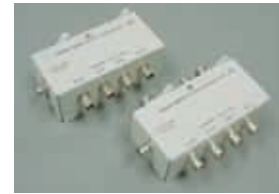
9268 DC BIAS VOLTAGE UNIT Maximum applied voltage: \pm 40 V DC 9269 DC BIAS CURRENT UNIT Maximum applied current: \pm 2 A DC