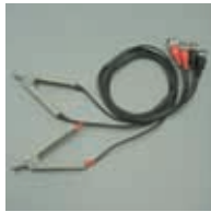
9140 FOUR-TERMINAL PROBE DC to 100 kHz