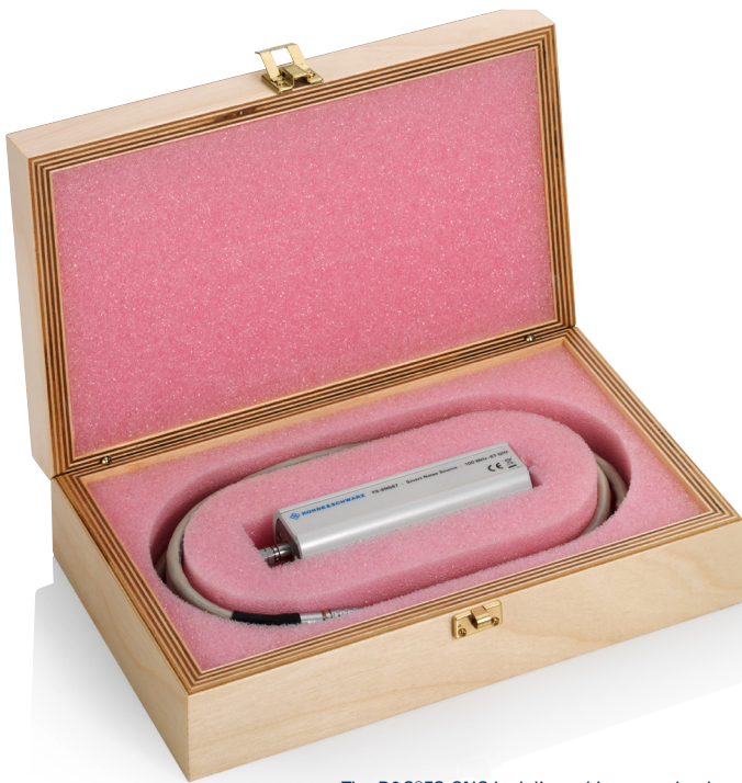
The R&S®FS-SNS is delivered in a wooden box.