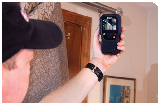
Scanning ceiling & wall joint for moisture issues