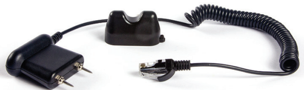
MR02 Pin Probe included