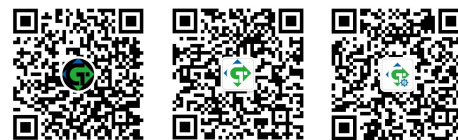
微信视频号 绿测科技订阅号 绿测工场服务号

广州总部：广州市番禺区陈边村金欧大道83号江潮创意园A栋208室 深圳分公司：深圳市龙华区龙华街道 油松社区东环一路1号耀丰通工业园1-2栋2栋607 南宁分公司：广西自由贸易试验区南宁片区五象大道401号五象航洋城1号楼3519号 广州分公司：广州市南沙区凤凰大道89号中国铁建·凤凰广场B栋1201房 电话：020-2204 2442 传真：020-8067 2851 邮箱：Sales@greentest.com.cn 官网：www.greentest.com.cn